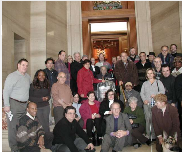
Supreme Court Victory! Dec. 2003